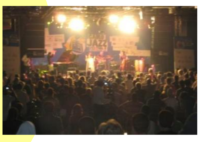
Received an enthusiastic response at Cairo Jazz Festival. <mark>←Phot</mark>os and an interview of Kuriya are on the full front page of "Al-Ahram," the largest-circulation paper in Egypt.